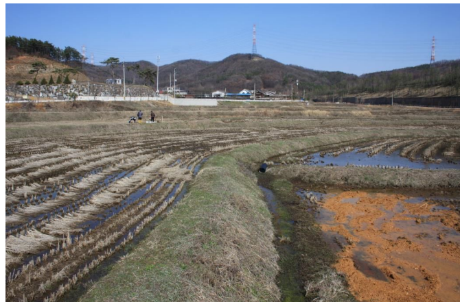
Morphological properties of typifying pedon.